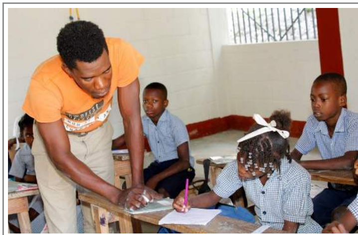
You make it possible for a teacher to obtain a living wage.