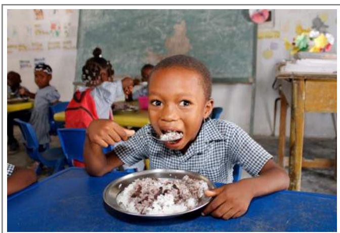
You make it possible for a child to enjoy a hot lunch each day.