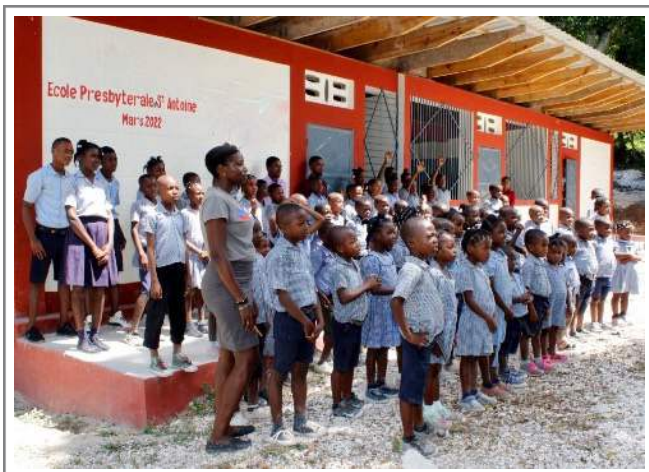
You make it possible for a child to receive an education.