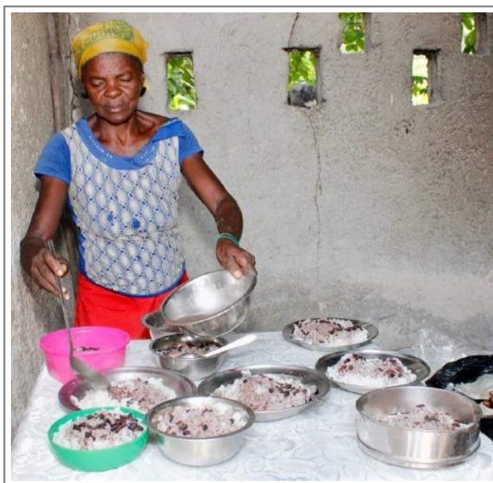
You make it possible for a school employee to receive a fair wage.