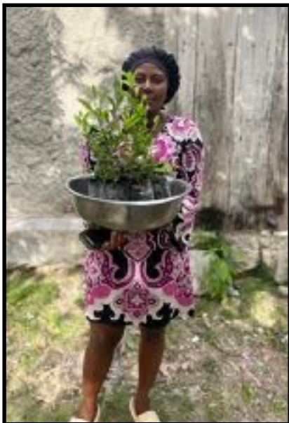
Holding seedlings for the coming season, a farmer carries hope forward.

Each season builds on the one before it. As farmers prepare for the months ahead, the work of planting, learning, and working together continues—rooted in patience and care for the land. With steady support, the Tree Currency Program will move forward into the next season, guided by the same commitment that has shaped the work so far.