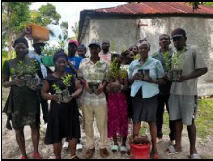
Farmers hold young tree seedlings ready for planting—each one an investment in land, livelihoods, and the future.

Tree Currency works because it connects care for the land with care for families. By earning trees through participation, training, and community effort, farmers invest time and labor in something that gives back over many years. Trees protect soil, improve harvests, and provide long-term value—making them a natural currency for building resilience and stability in rural communities. In this way, Tree Currency turns shared effort into lasting value.