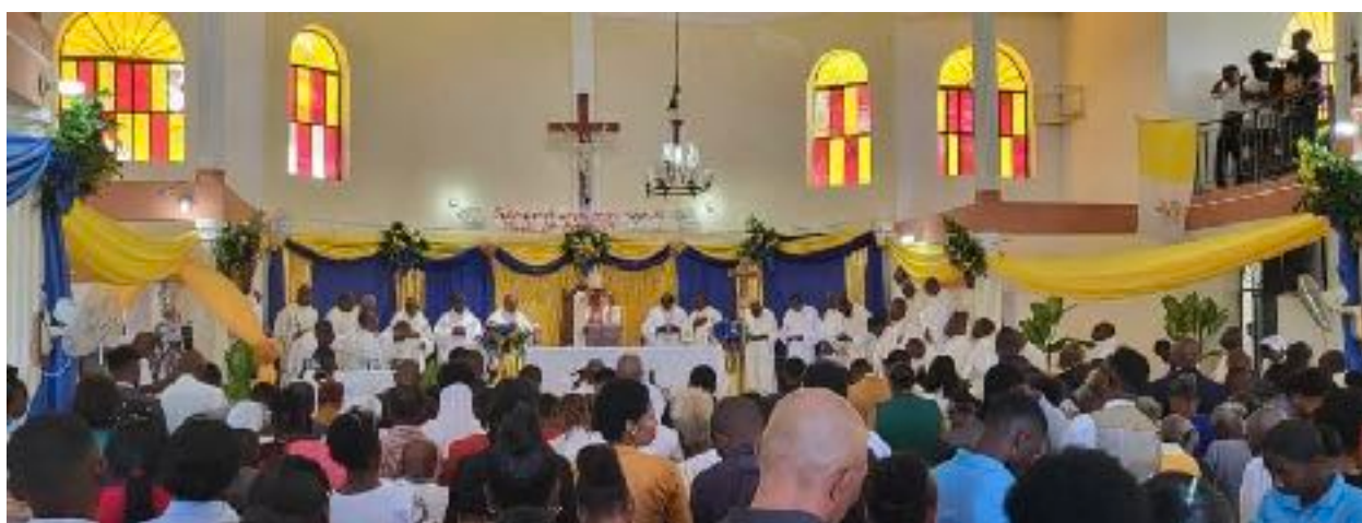
Thirty-seven priests concelebrate the Mass with the faithful gathered in unity.