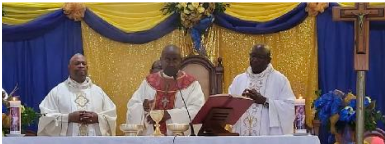
The Bishop celebrates the Eucharist for the Feast of St. Joseph.