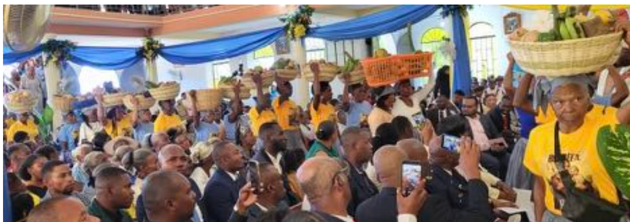
Offertory procession featuring the produce of the land, offered in thanksgiving.