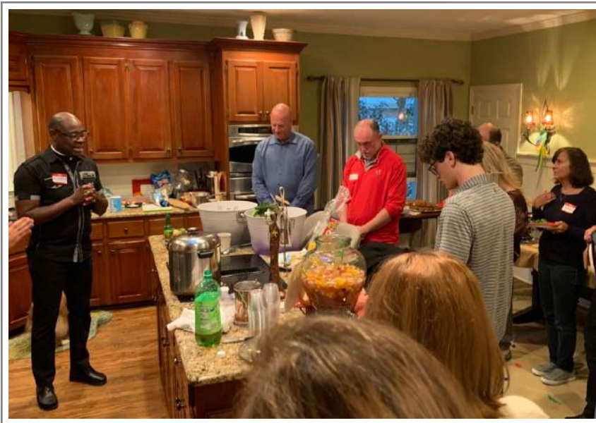
After the blessing, guests enjoyed a pre-Thanksgiving turkey dinner.

Thanks to friends and family $1600 was raised to support our twin parish.