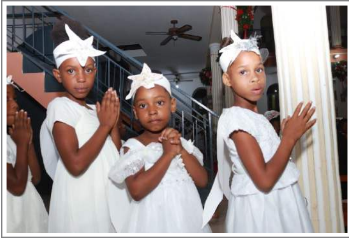
St. Joseph Christmas Celebration 2022

"In this sacred season of Christmas, our hearts overflow with joy, celebrating the birth of the Christ Child. For our Catholic community at St. William, it's also a time of compassion as we pray for our brothers and sisters in Côtés-de-Fer.