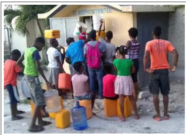
You provide water to Cotes-de-Fer residents.

For the past five years Helping Hugs for Haiti has supported an effort to bring clean, drinkable water to St. Joseph's Church in Côtés-de-Fer and the surrounding communities. This program is the result of findings by our annual Medical Mission which concluded many illnesses in Haiti were waterborne due to non-potable water and poor hygiene. People get their water from contaminated rivers and streams.