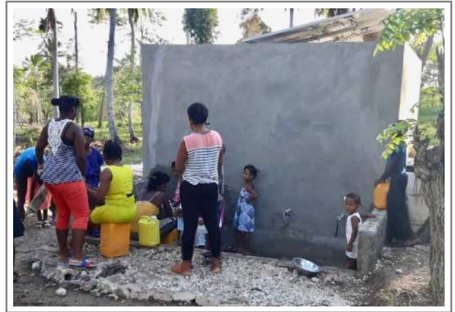
Note solar panels on the top of the cistern. Solar power activates the pump to bring water from the well to the cistern.

In 2021, we were saved by strangers (from St. William) who donated a well. And that's when our life of hardship came to an end. Since then, a new life has begun for us.