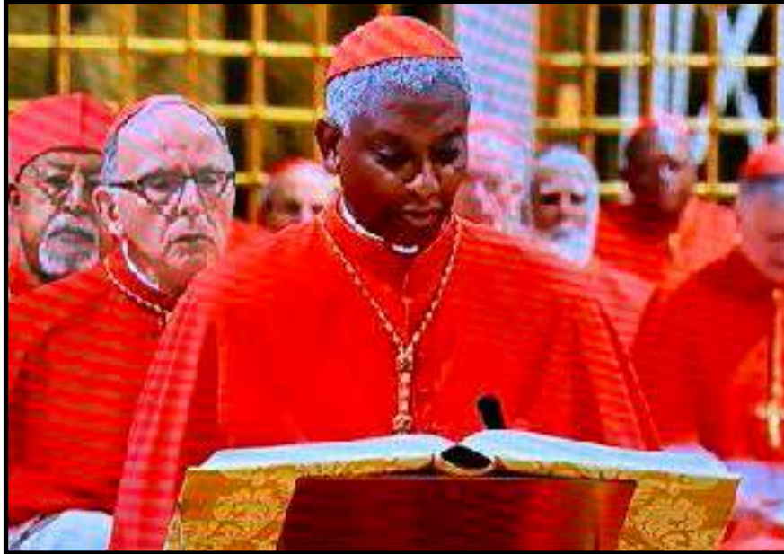
Cardinal Chibly Langlois, the first Haitian cardinal, stands among his peers as he takes the oath of secrecy and fidelity before voting for the new pope.

In an extraordinary moment for the global Church—and for Haiti—history unfolded in the Sistine Chapel. When the doors closed and the cardinals gathered to elect the successor to Pope Francis, two “firsts” quietly echoed through the sacred space: