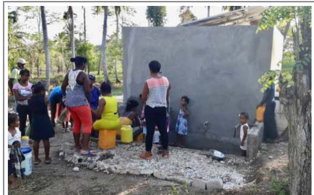
2021 Mont Blanc - Well