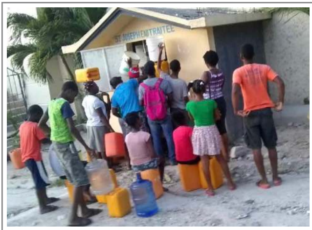
2016 Côtes-de-Fer - Water Treatment