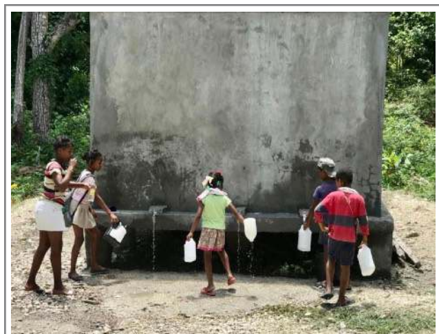
2022 Boucan Moran - Well