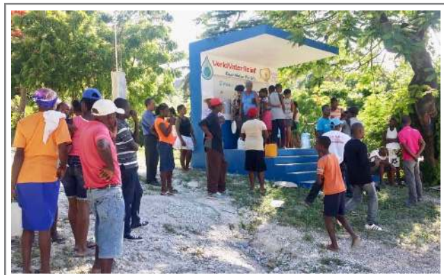
2018 Mayette - Water Treatment