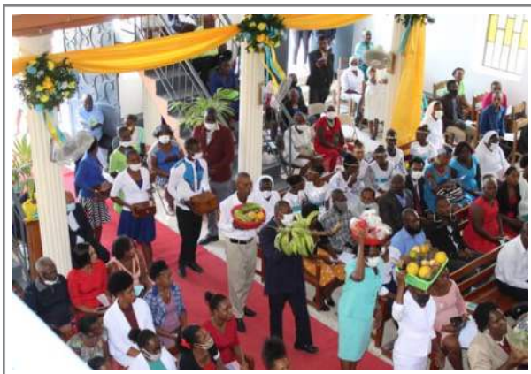
The most colorful part of the mass is the offeratory procession of food.