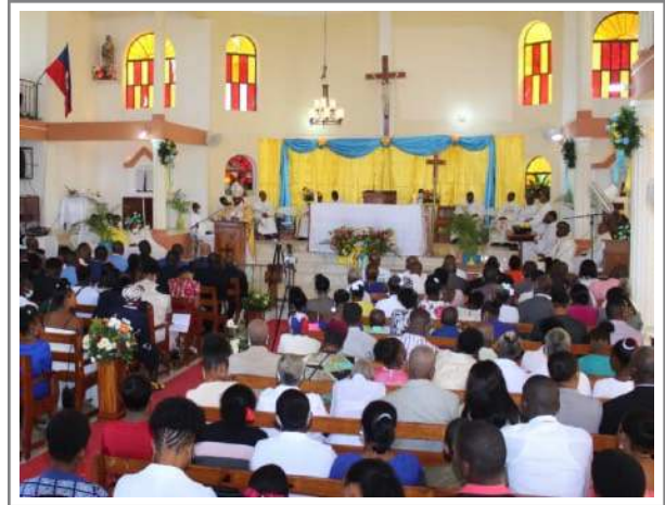
It's standing room only on St. Joseph's feast day.