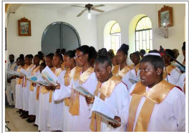
One of several choirs that perform during the celebration mass.