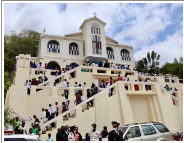
The community gathers at St. Joseph Church for the feast.

Your contributions to the bi-monthly basket collection support this parish activity.