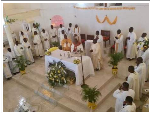
Priests throughout the diocese gather to celebrate parish feast days.