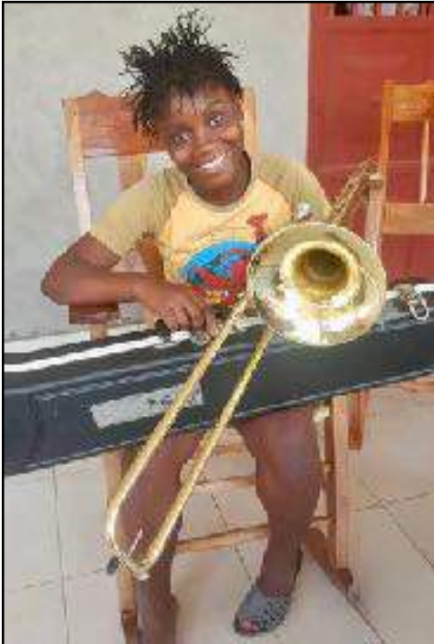
Summer programs keep children learning and safe.