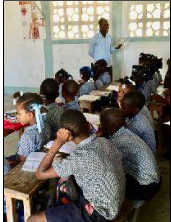
Early education builds literacy, confidence, and routine.