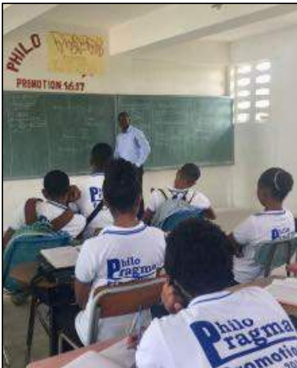
Continued support for high school students keeps teens in school as costs rise.