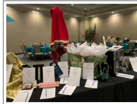
Friday afternoon the tables are ready and the silent auction is displayed.