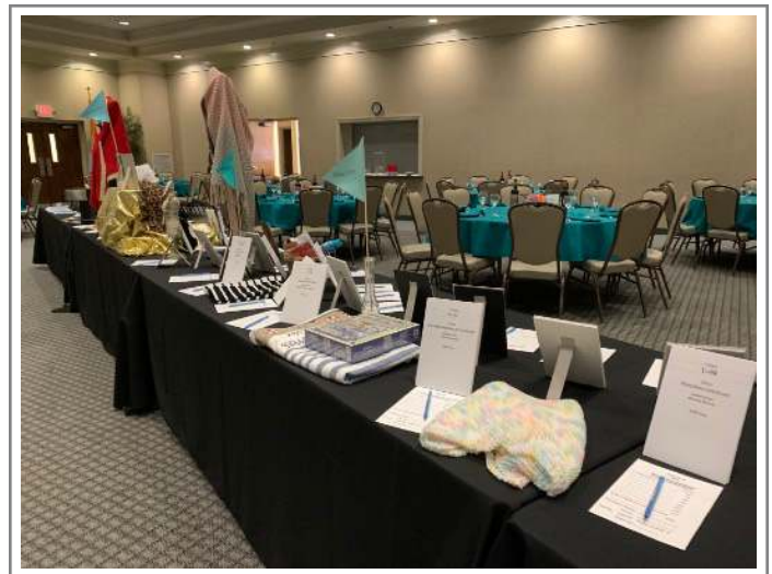
Approximately 75 items were offered in the silent auction. Thank you to everyone responsible for donating, securing and purchasing these items.