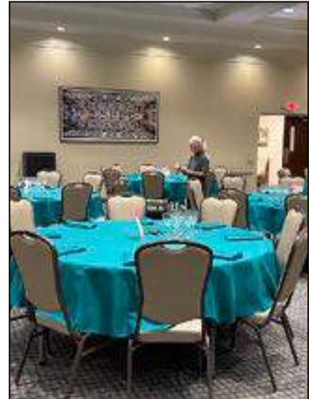
Jo double-checks the seating plan