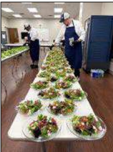
Sea Island employees prepare the salad before refrigeration.