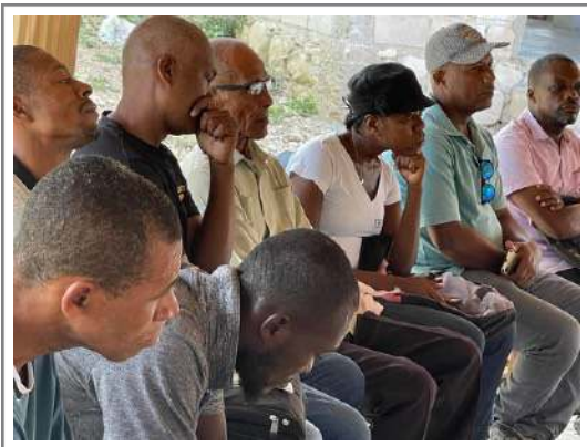
Men & Women Planters of Côtes-de-Fer

Then it was time for the planters to let the agronomists know what interests them in the field of agriculture and to present the difficulties they face.